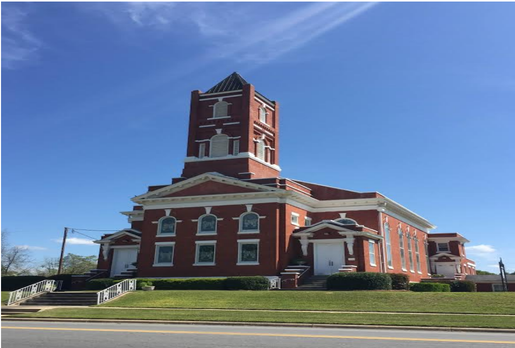
ASHBURN, GA FEBRUARY/MARCH 2017